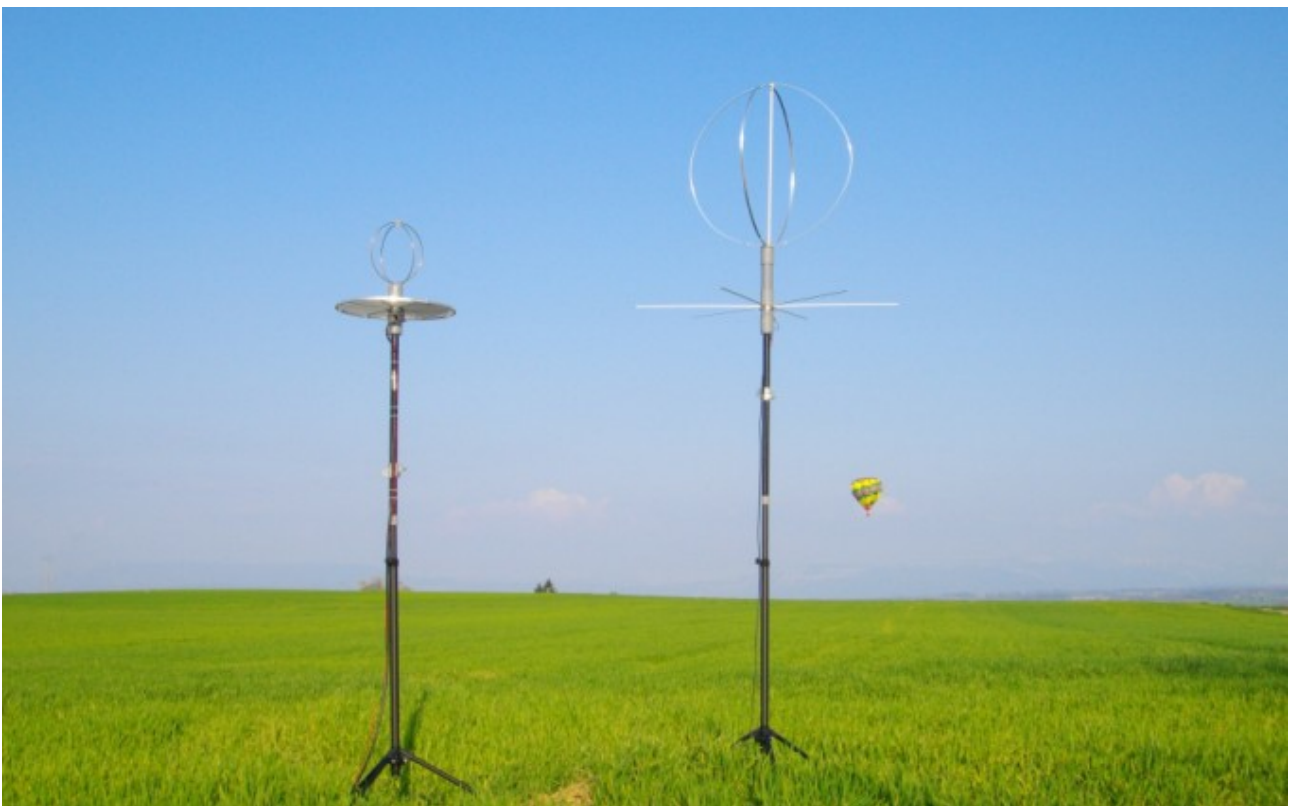
ON6WG - F5VIF/P ~ "Eggbeater" UHF / VHF antennas